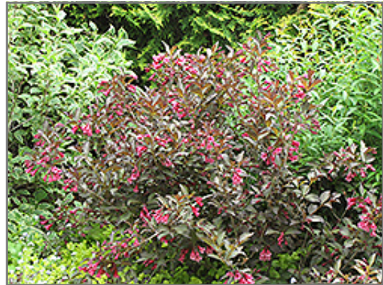
Midnight Wine Weigela in bloom