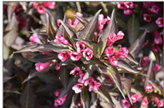
Midnight Wine Weigela flowers