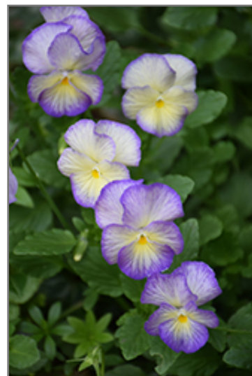
Etain Pansy flowers