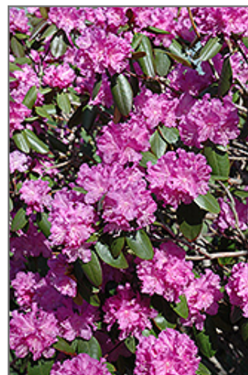
P.J.M. Rhododendron flowers