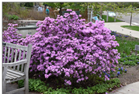
P.J.M. Rhododendron in bloom

P.J.M. Rhododendron is recommended for the following landscape applications;