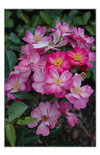
Daydream Rose flowers