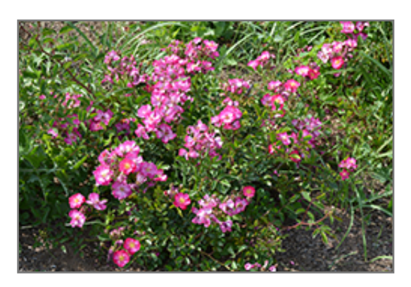
Daydream Rose in bloom