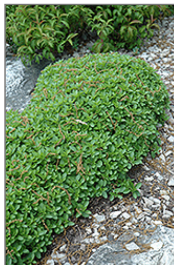
Dwarf Oregano