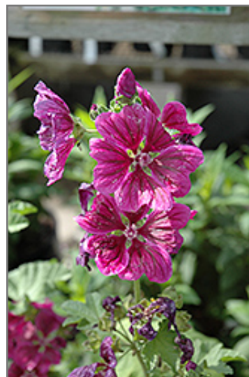
Tree Mallow flowers