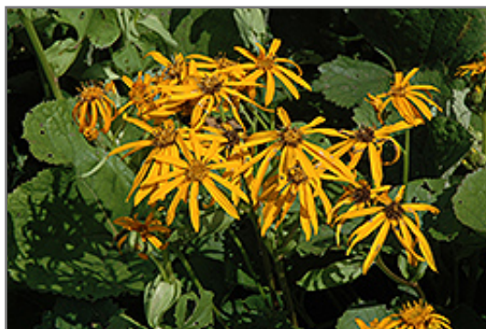
Othello Rayflower flowers