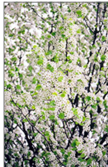
Bradford Ornamental Pear flowers