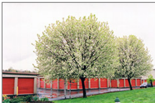
Bradford Ornamental Pear in bloom

Bradford Ornamental Pear is recommended for the following landscape applications;