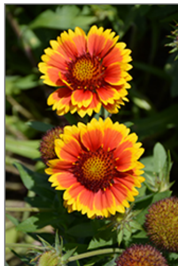
Arizona Sun Blanket Flower flowers

Arizona Sun Blanket Flower is recommended for the following landscape applications;