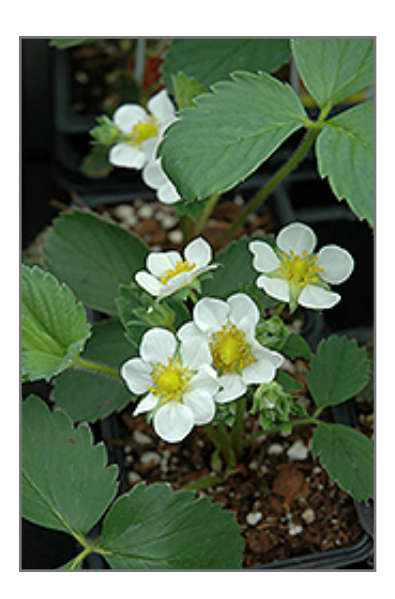
Fort Laramie Strawberry flowers