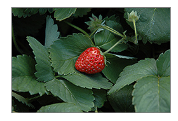
Fort Laramie Strawberry fruit

Fort Laramie Strawberry features dainty white daisy flowers with yellow eyes along the stems from late spring to mid summer. Its tomentose round compound leaves remain green in colour throughout the season. It features an abundance of magnificent scarlet berries from early to late summer.