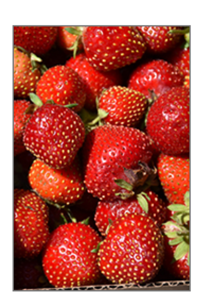
Fort Laramie Strawberry fruit

Fort Laramie Strawberry is a good choice for the edible garden, but it is also well-suited for use in outdoor pots and containers. Because of its spreading habit of growth, it is ideally suited for use as a 'spiller' in the 'spiller-thriller-filler' container combination; plant it near the edges where it can spill gracefully over the pot. Note that when growing plants in outdoor containers and baskets, they may require more frequent waterings than they would in the yard or garden.