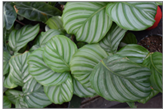
Color Full Orbifolia Prayer Plant foliage