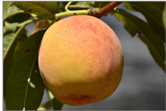
Reliance Peach fruit

Reliance Peach is clothed in stunning clusters of fragrant pink flowers along the branches in early spring, which emerge from distinctive rose flower buds before the leaves. It has dark green deciduous foliage. The narrow leaves turn yellow in fall. The fruits are showy yellow drupes with a red blush, which are carried in abundance in mid summer. The fruit can be messy if allowed to drop on the lawn or walkways, and may require occasional clean-up.