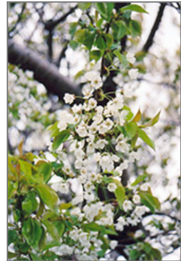
Sweet Cherry flowers

Sweet Cherry is covered in stunning clusters of fragrant white flowers hanging below the branches in early spring before the leaves. It has dark green deciduous foliage. The pointy leaves turn yellow in fall. The fruits are showy red drupes carried in abundance in mid summer. The fruit can be messy if allowed to drop on the lawn or walkways, and may require occasional clean-up. The smooth dark red bark adds an interesting dimension to the landscape.