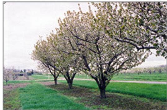
Sweet Cherry in bloom