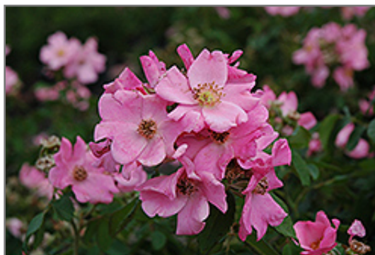
Polar Joy Rose flowers

Polar Joy Rose is recommended for the following landscape applications;