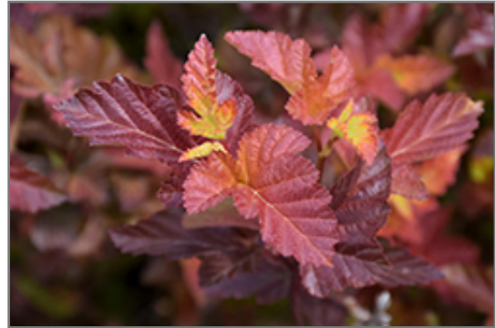
Center Glow Ninebark foliage

Center Glow Ninebark is recommended for the following landscape applications;