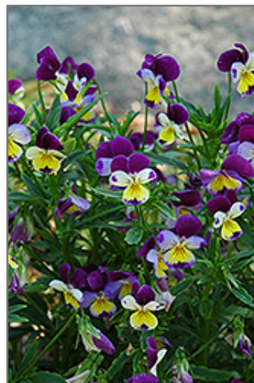
Johnny Jump-Up flowers