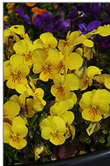
Penny Yellow Pansy flowers