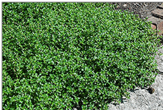
Spanish Thyme