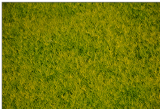
Scotch Moss foliage