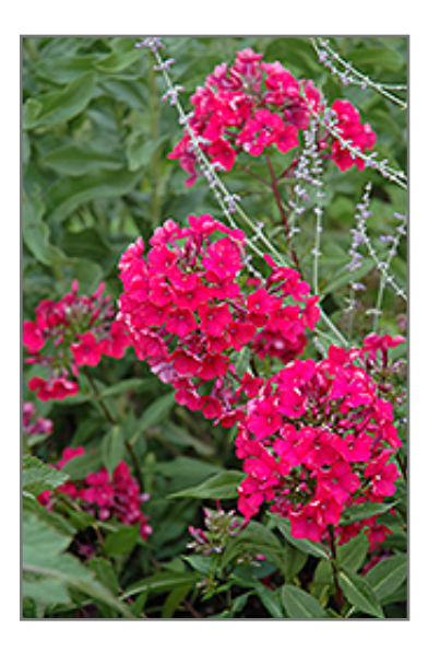
Starfire Garden Phlox flowers

Starfire Garden Phlox features bold fragrant conical cherry red star-shaped flowers at the ends of the stems from early summer to early fall. The flowers are excellent for cutting. Its narrow leaves remain green in colour throughout the season.