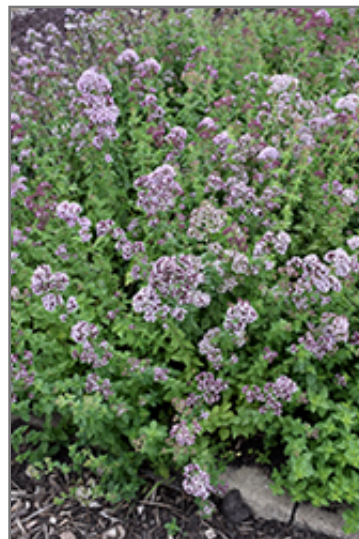
Oregano flowers