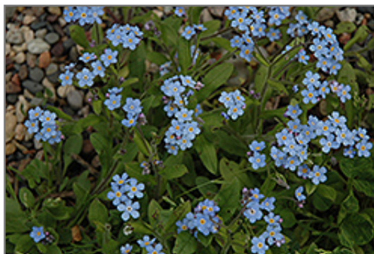
Forget-Me-Not flowers