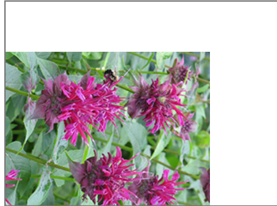
Raspberry Wine Beebalm flowers

Raspberry Wine Beebalm will grow to be about 30 inches tall at maturity, with a spread of 32 inches. When grown in masses or used as a bedding plant, individual plants should be spaced approximately 28 inches apart. It grows at a fast rate, and under ideal conditions can be expected to live for approximately 5 years. As an herbaceous perennial, this plant will usually die back to the crown each winter, and will regrow from the base each spring. Be careful not to disturb the crown in late winter when it may not be readily seen!