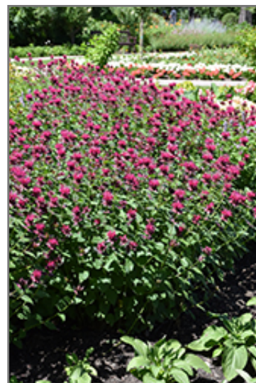
Raspberry Wine Beebalm in bloom