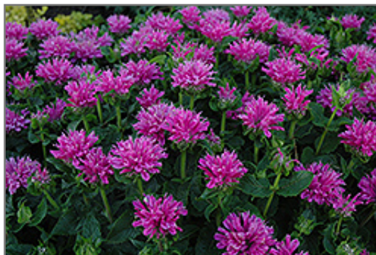
Petite Delight Beebalm flowers