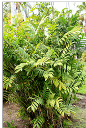
Hardy Bamboo Palm