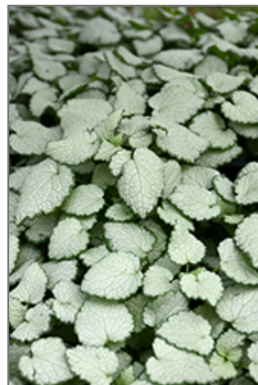
Red Nancy Spotted Dead Nettle foliage

Red Nancy Spotted Dead Nettle is a fine choice for the garden, but it is also a good selection for planting in outdoor pots and containers. Because of its spreading habit of growth, it is ideally suited for use as a 'spiller' in the 'spiller-thriller-filler' container combination; plant it near the edges where it can spill gracefully over the pot. Note that when growing plants in outdoor containers and baskets, they may require more frequent waterings than they would in the yard or garden.