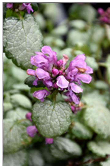
Red Nancy Spotted Dead Nettle flowers