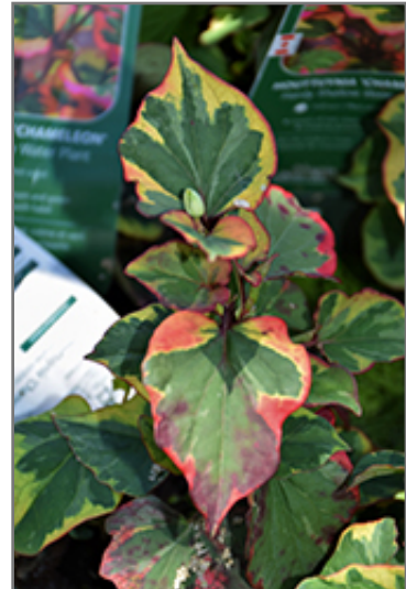
Variegated Chameleon Plant foliage