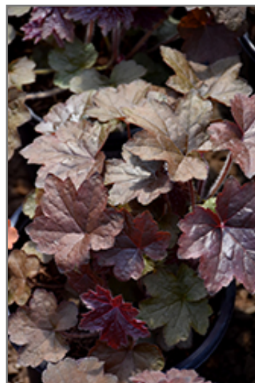
Palace Purple Coral Bells foliage

Palace Purple Coral Bells is recommended for the following landscape applications;