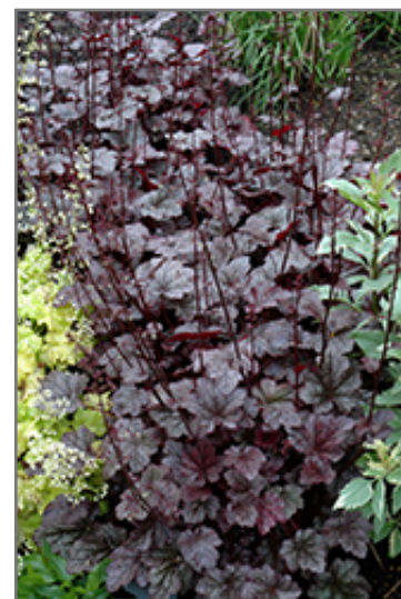
Plum Pudding Coral Bells in bloom