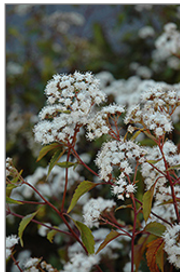
Chocolate Boneset flowers

Chocolate Boneset is recommended for the following landscape applications;