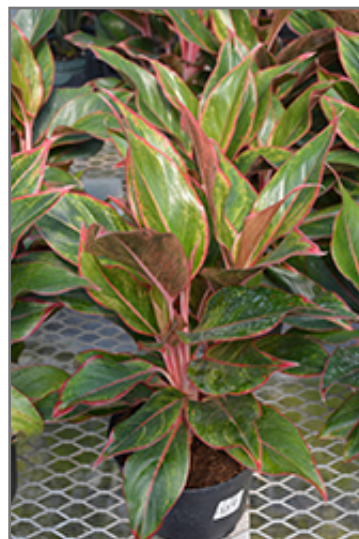
Siam Aurora Chinese Evergreen in full