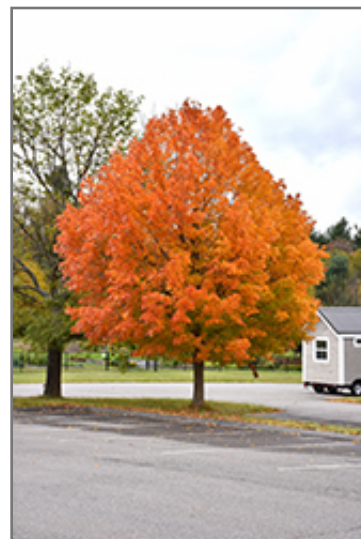
Sugar Maple in fall