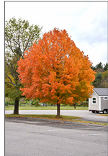
Sugar Maple in fall