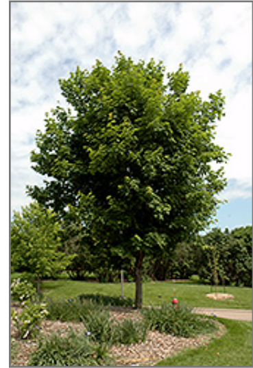
Sugar Maple

This tree should only be grown in full sunlight. It prefers to grow in average to moist conditions, and shouldn't be allowed to dry out. It is not particular as to soil pH, but grows best in rich soils. It is somewhat tolerant of urban pollution. This species is native to parts of North America.