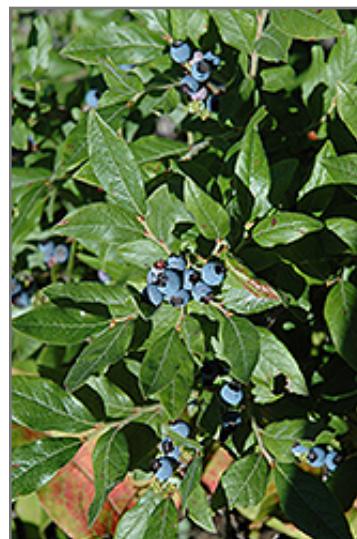
Lowbush Blueberry fruit

This is an open spreading deciduous shrub with a spreading, ground-hugging habit of growth. Its relatively fine texture sets it apart from other landscape plants with less refined foliage. This is a relatively low maintenance plant, and usually looks its best without pruning, although it will tolerate pruning. It is a good choice for attracting birds to your yard. It has no significant negative characteristics.