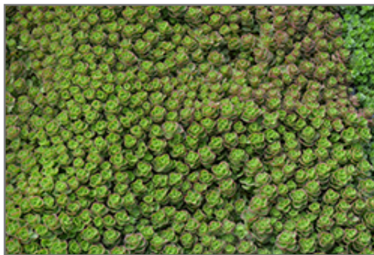
Dragon's Blood Stonecrop foliage