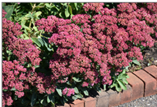
Carl Stonecrop in bloom

This is a relatively low maintenance plant, and is best cleaned up in early spring before it resumes active growth for the season. It is a good choice for attracting bees and butterflies to your yard, but is not particularly attractive to deer who tend to leave it alone in favor of tastier treats. It has no significant negative characteristics.