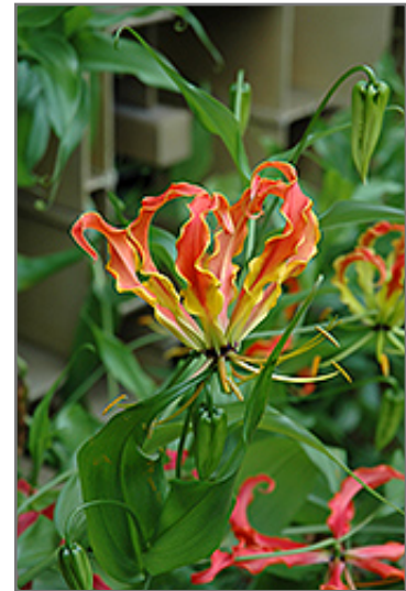
Gloriosa Lily flowers

Gloriosa Lily is recommended for the following landscape applications;