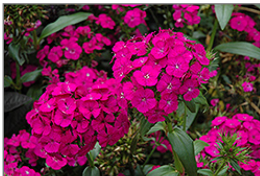
Amazon Neon Purple Pinks flowers

Amazon Neon Purple Pinks is recommended for the following landscape applications;