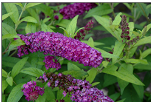
Monarch Crown Jewels Butterfly Bush flowers

Monarch Crown Jewels Butterfly Bush is recommended for the following landscape applications;