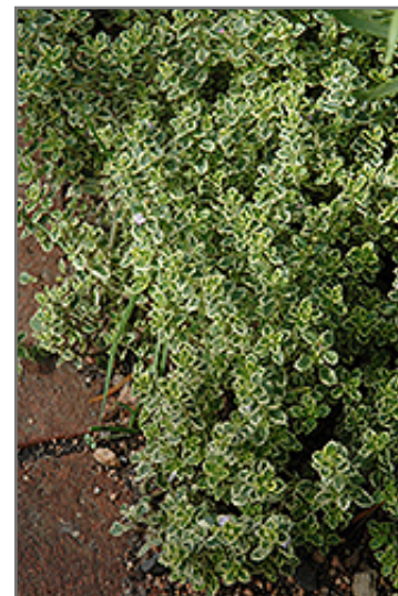
Aureus Lemon Thyme foliage