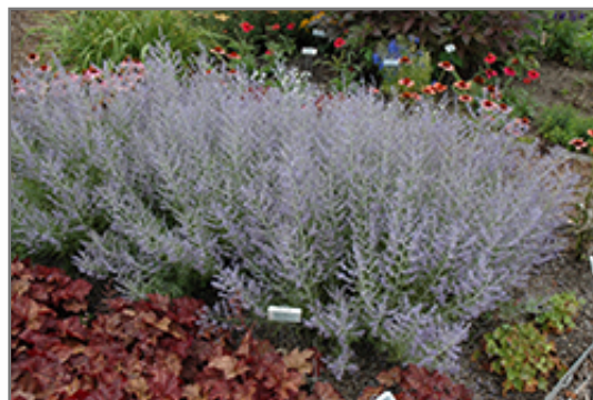
Peek-A-Blue Russian Sage in bloom

Peek-A-Blue Russian Sage is recommended for the following landscape applications;