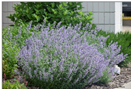
Cat's Meow Catmint in bloom