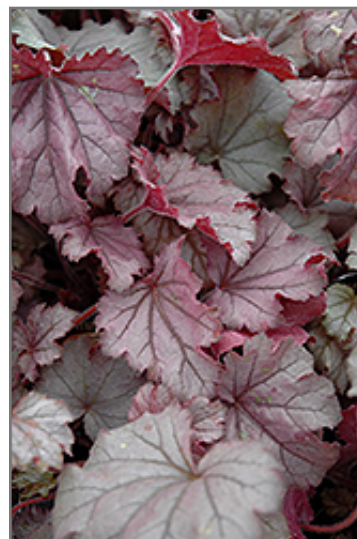
Little Cuties Sugar Berry Coral Bells foliage

Little Cuties Sugar Berry Coral Bells is recommended for the following landscape applications;