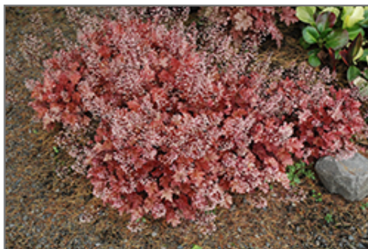
Peach Crisp Coral Bells in bloom

Peach Crisp Coral Bells is recommended for the following landscape applications;