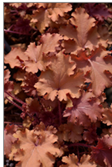
Peach Crisp Coral Bells foliage

Peach Crisp Coral Bells will grow to be about 14 inches tall at maturity extending to 20 inches tall with the flowers, with a spread of 18 inches. When grown in masses or used as a bedding plant, individual plants should be spaced approximately 15 inches apart. Its foliage tends to remain dense right to the ground, not requiring facer plants in front. It grows at a medium rate, and under ideal conditions can be expected to live for approximately 10 years. As an evergreen perennial, this plant will typically keep its form and foliage year-round.