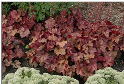
Lava Lamp Coral Bells

Lava Lamp Coral Bells is a fine choice for the garden, but it is also a good selection for planting in outdoor pots and containers. With its upright habit of growth, it is best suited for use as a 'thriller' in the 'spiller-thriller-filler' container combination; plant it near the center of the pot, surrounded by smaller plants and those that spill over the edges. Note that when growing plants in outdoor containers and baskets, they may require more frequent waterings than they would in the yard or garden.