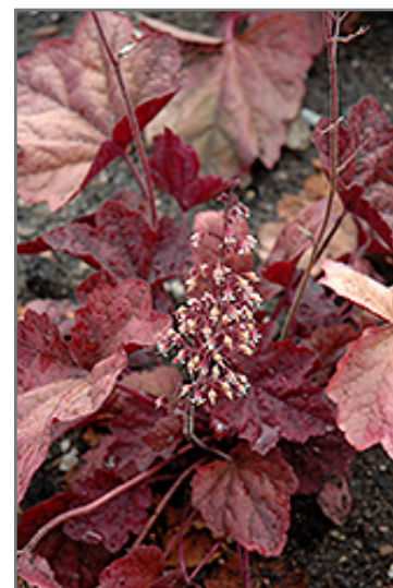
Lava Lamp Coral Bells flowers