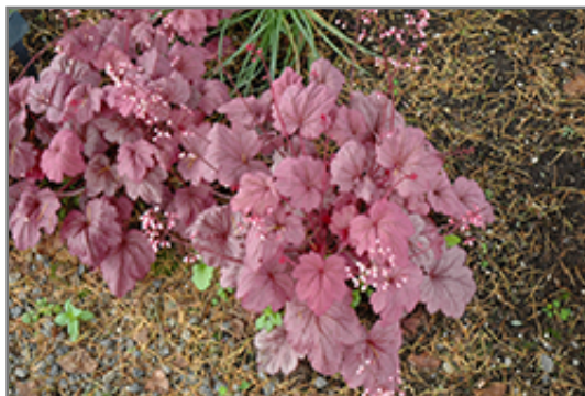
Georgia Plum Coral Bells