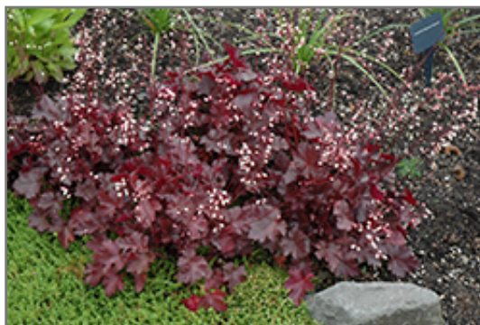
Little Cuties Coco Coral Bells in bloom

Little Cuties Coco Coral Bells is recommended for the following landscape applications;