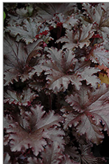
Black Taffeta Coral Bells foliage

Black Taffeta Coral Bells is recommended for the following landscape applications;