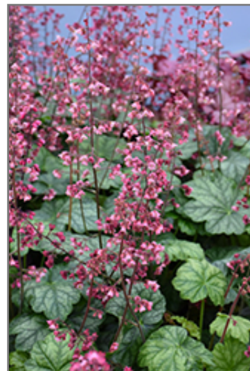
Berry Timeless Coral Bells flowers