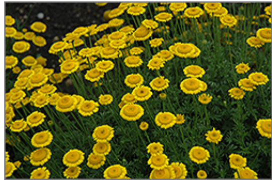
Charme Marguerite Daisy flowers