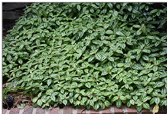
Aluminum Plant